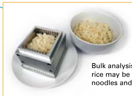
Bulk analysis of all varieties of rice may be tested, as well as noodles and other similar foods