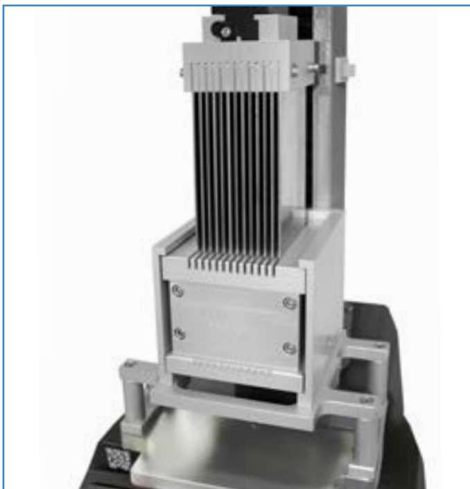
Thin-blade CS-2 Kramer Shear Cell for smaller rice grains