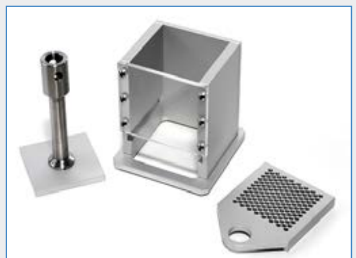
A suitable ISO11747 Rice Extrusion Cell

Mecmesin reserves the right to alter equipment specifications without prior notice. E&OE.