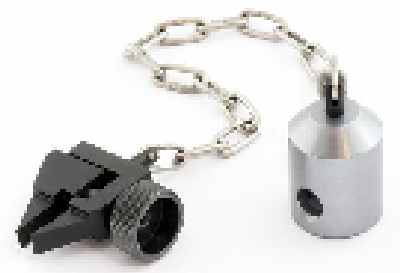
MecS341 with chain and adapter