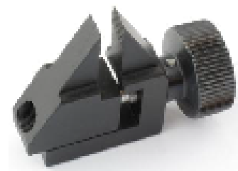
Close-up of MecS341