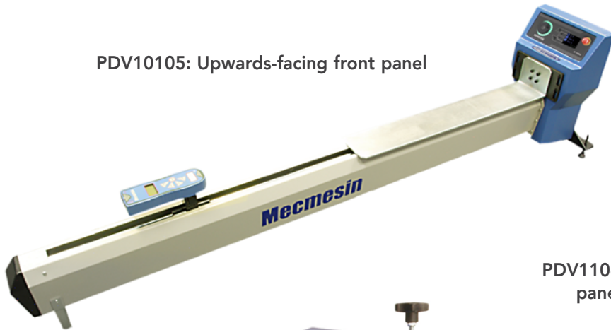
PDV10105: Upwards-facing front panel