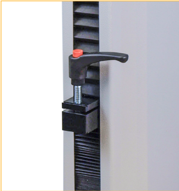
Protective Bellows Kit