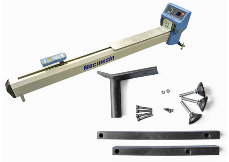
PDV11065, PDV10105: Horizontal Feet Kit for single-column test stands