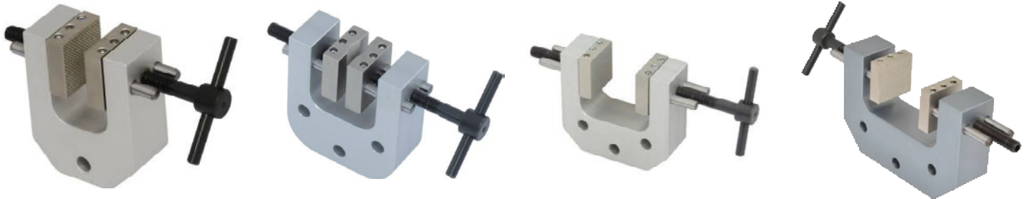
Mec240k - 2.5 kN