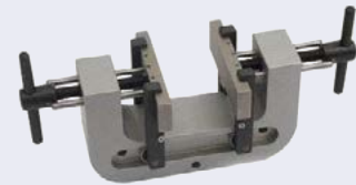
Shown fitted with a half-set of Mec240g-BD80 diamond jaws.

Mechanical Vice Grips apply a clamping force by manually tightening parallel jaw faces directly onto the specimen. Double-action vice grips allow free adjustment of both jaws, allowing them to be aligned around the central axis to accommodate tensile testing of both symmetrical and asymmetrical specimens. The 'U-Form' cut into the aluminium body of these Pneumatic Vice Grips creates the space for an operator to have specimen material below the jaws thereby facilitating loading and removal when testing.