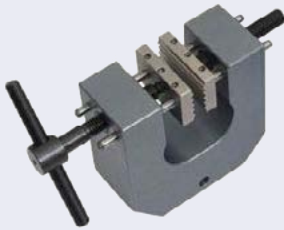
Shown fitted with a half-set of Mec240g-BW wave jaws