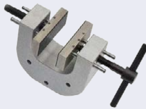
Shown fitted with a half-set of Mec240g-BG80 rubber jaws