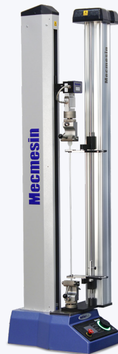
MLTE 1200 mounted on MultiTest-dV 0.5 kN