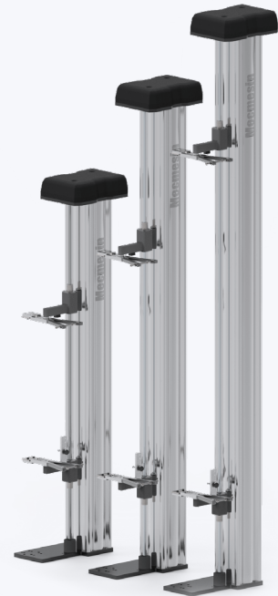
▲ MLTE 700, MLTE 1000 and MLTE 1200

VectorPro MT is Mecmesin's dedicated materials testing software, used for the programming, control and acquisition of data from OmniTest and MultiTest-dV systems. It captures at high-speed the signals from load cells and extensometers, graphically displays stress/strain data and performs common materials testing calculations with the flexible transfer of raw data and results to Excel™ or a PDF™ report.