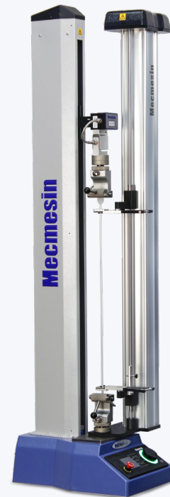
▲ MLTE 1200 mounted on MultiTest-dV 0.5 kN