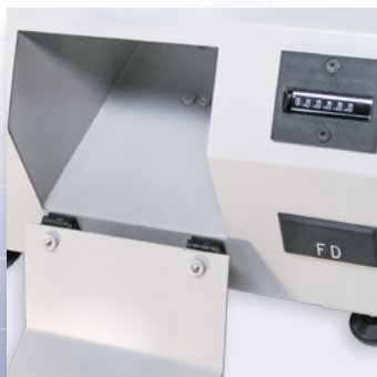
▲ Dart well (includes foam pad) and dart drop counter (FD2, FD3)