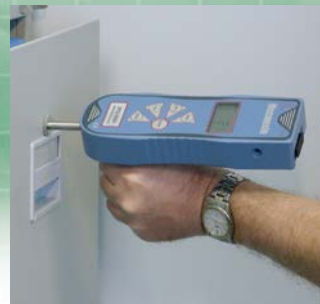
testing force to close cabinet drawer