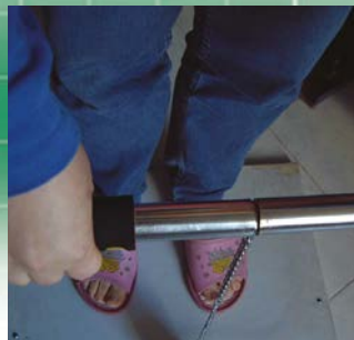
testing lumbar extension