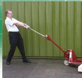
testing force to pull loaded trolley