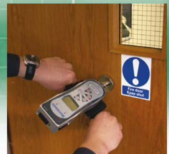
testing force to open fire door