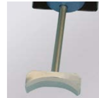
Padded Radiused Probe