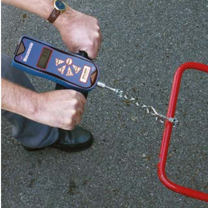
Mecmesin Basic Manual Handling Kit shown in use

It is essential to test manual handling in order to identify potential hazards that could cause harm. Equipment, which is susceptible to gradual wear or corrosion of wheels, bearings or hinges, may be regularly checked using force or torque testing instruments. This will highlight defects which can be addressed before they cause unnecessary accidents to operators or damage to products being transported.