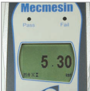
Mecmesin Advanced Manual Handling Kit displaying average force over time reading

Mecmesin provides easy analysis tools to evaluate job tasks and the capabilities of personnel insitu. Where the task involves exertion over a given period of time, continuous measurements are recorded and the average force, over the time period, is automatically calculated in addition to the peak strength required to perform the task.