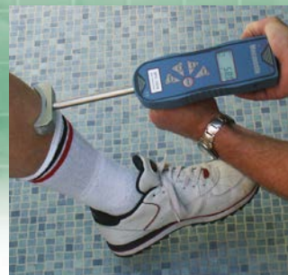
testing knee extension