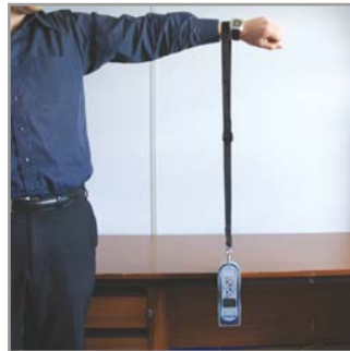
Mecmesin Advanced Manual Handling Kit testing shoulder abduction