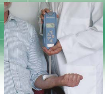
testing elbow flexion