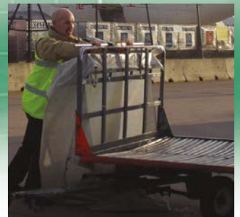
testing force to push cargo dolly

" As a leading handling agent in the air cargo industry our staff are often called upon to move heavy and unusual loads. We were seeking a tool that could help us measure the force for pushing and pulling aircraft pallets and trailers to ensure our teams health and safety. Mecmesin provided good assistance with helping us select a suitable product and have always been on hand to tackle any technical questions which we have had. " Servisair UK Limited