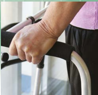
home health care